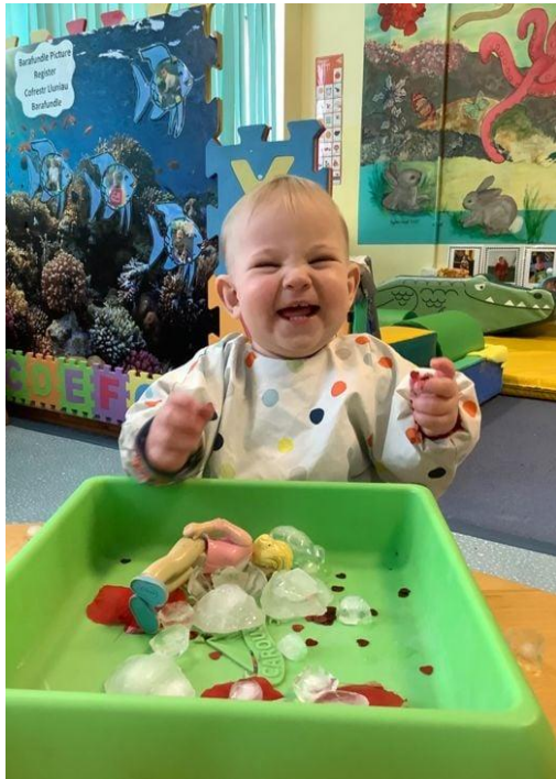
SPRING AND LIVING THINGS